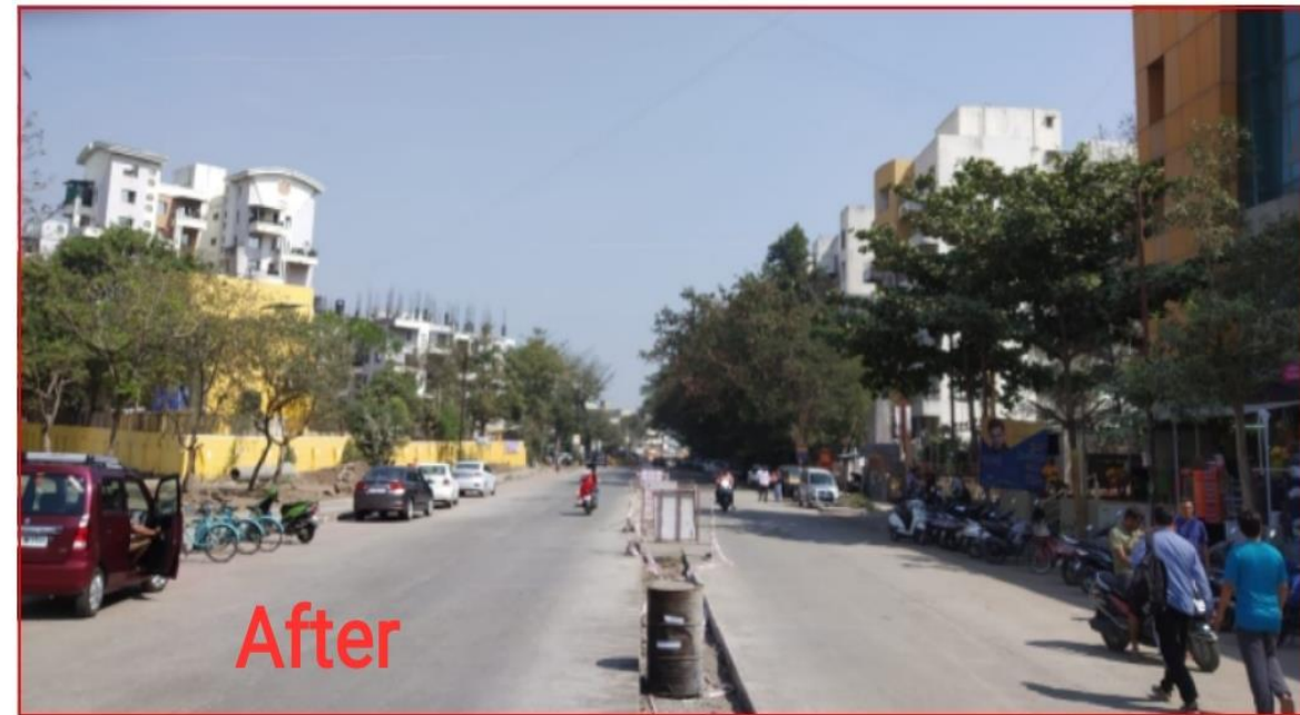
BALEWADI GAVTHON ROAD