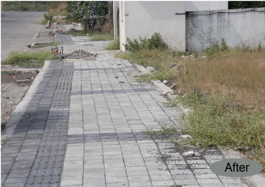
Baner Road 10.2Km (B1-B2)