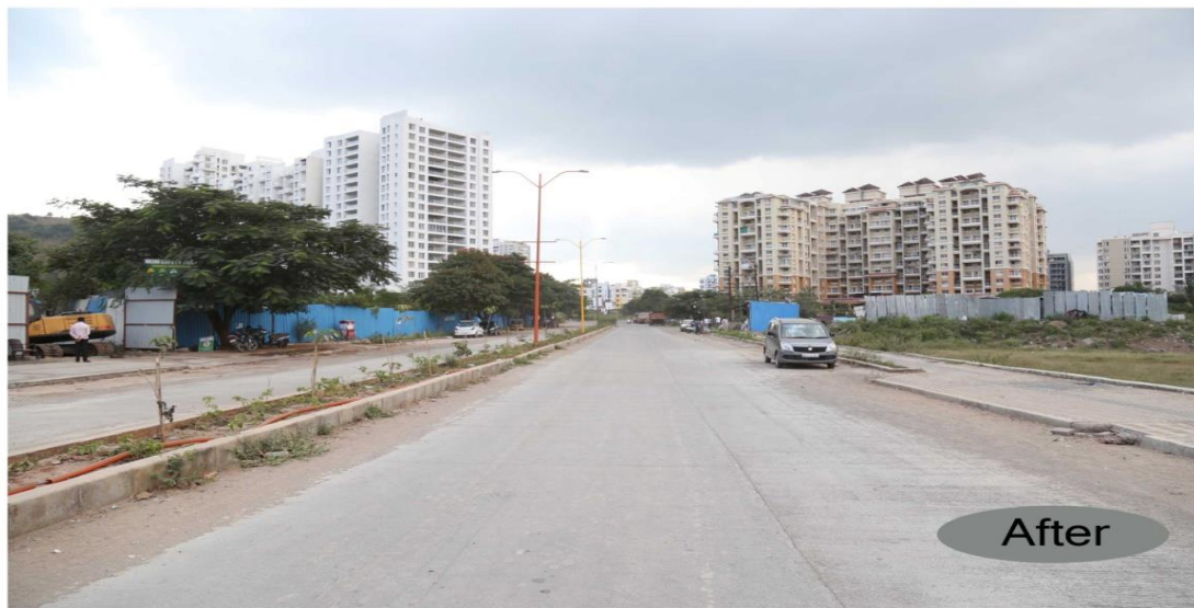
BANER ROAD 10.2km (B9-B14)