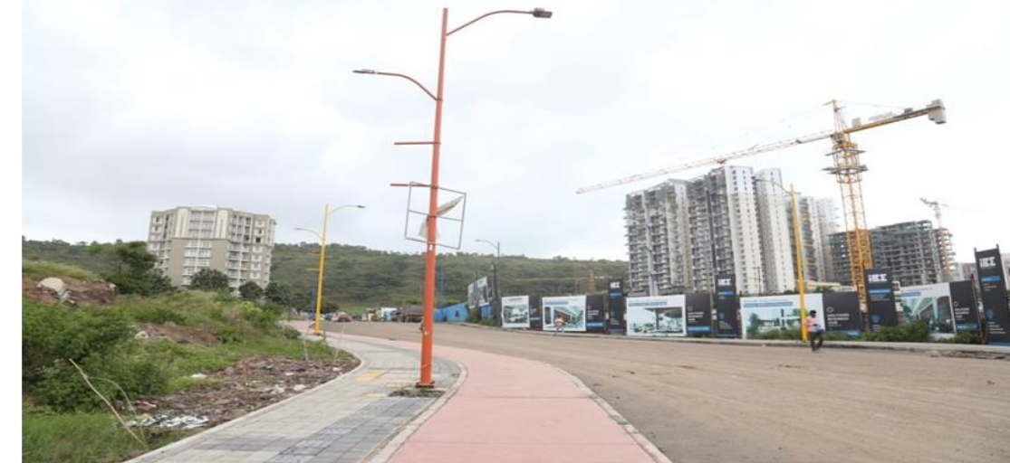
Baner Road 10.2Km (B17-B17A)