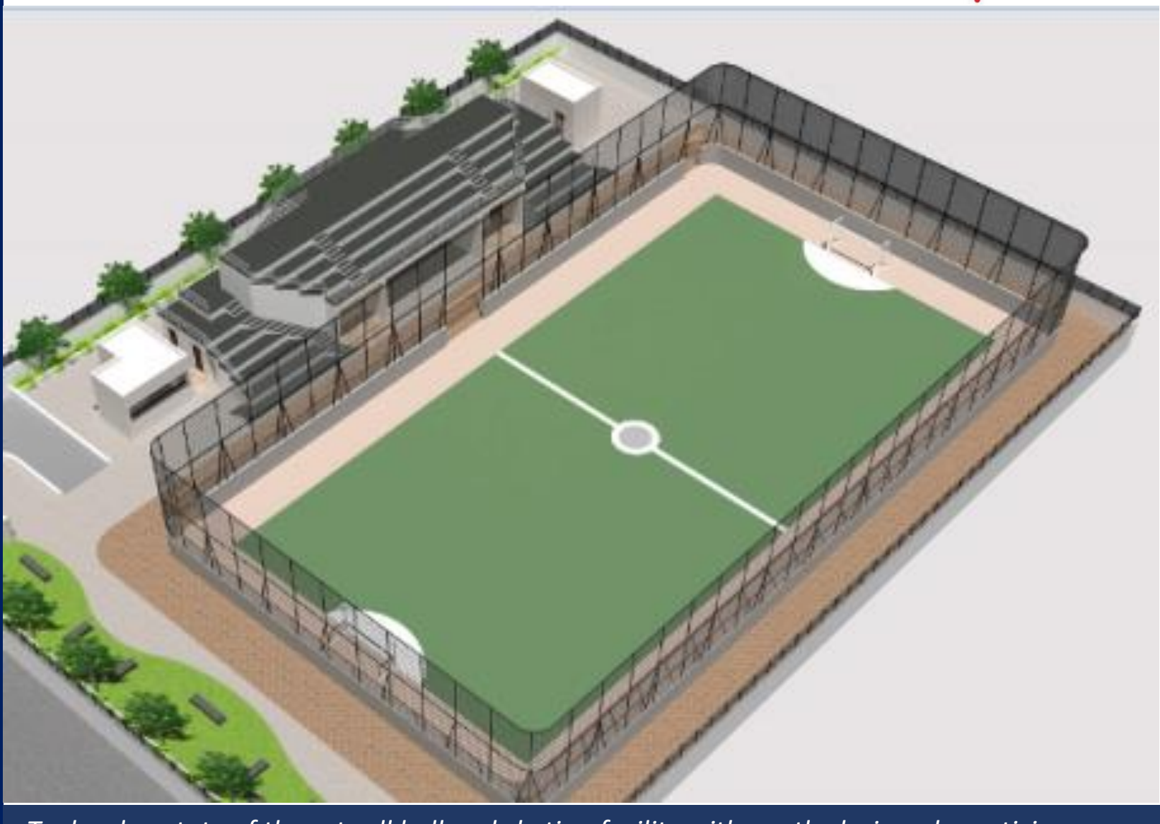
To develop state of the art roll ball and skating facility with neatly designed practicing space and landscaped spaces.