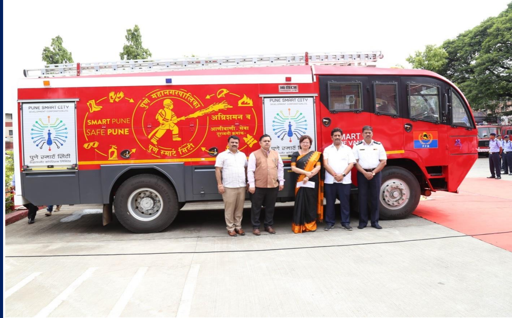
Smart Fire Hydrant