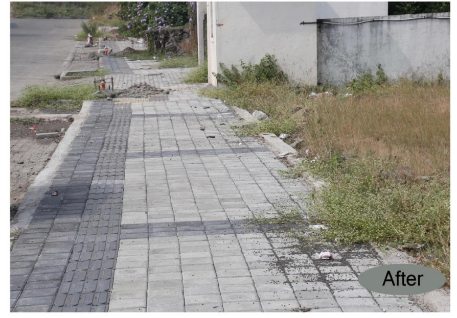
Baner Road 10.2Km (B1-B2)