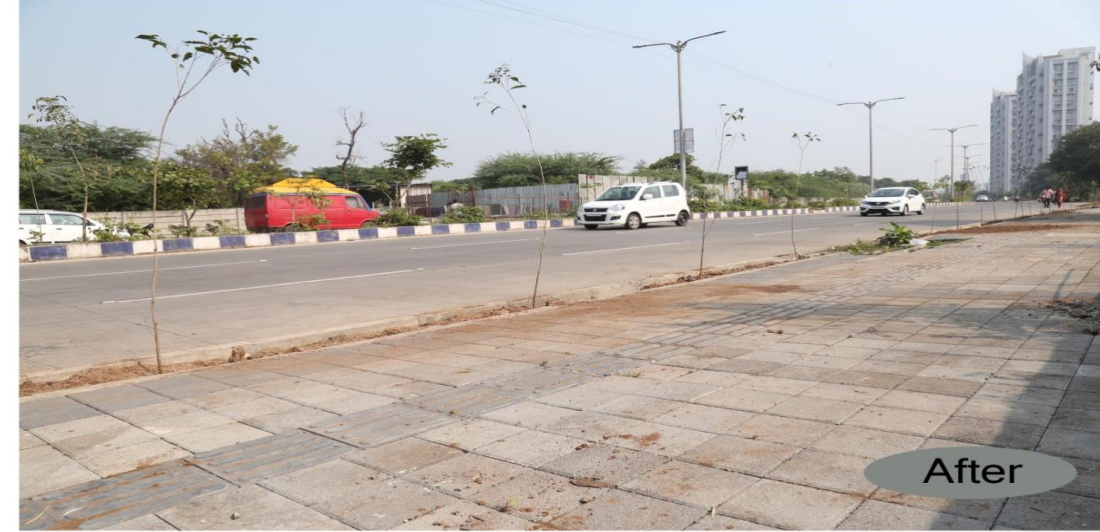
Baner Road 10.2Km (B18-B19)