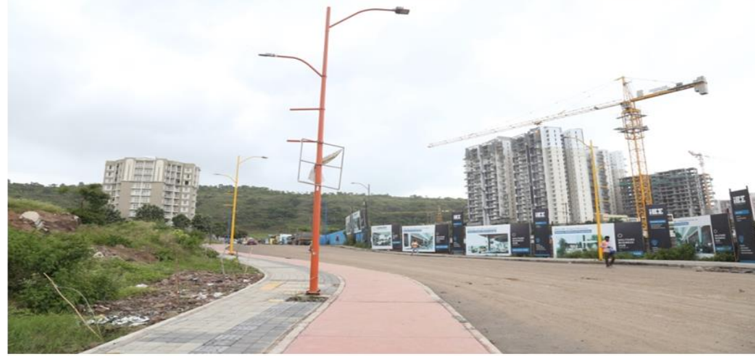
Baner Road 10.2Km (B17-B17A)