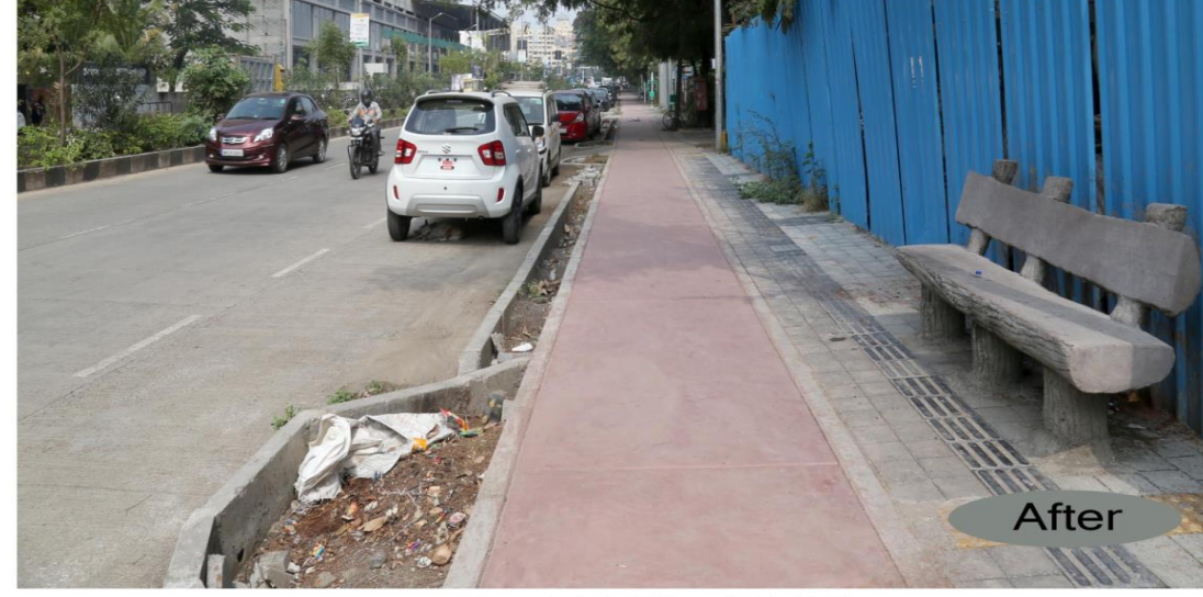
Baner Road 10.2Km (B1-B3)